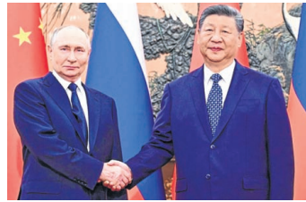
Russian President Vladimir Putin and Chinese President Xi Jinping shake hands ahead of their meeting at the Great Hall of the People in Beijing, China, Tuesday