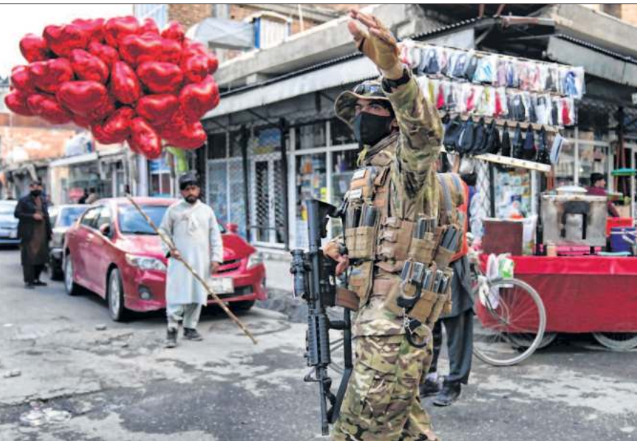
A Taliban fighter directs traffic as a street vendor sells red heart-shaped balloons for Valentine's Day, in Kabul, Afghanistan, Monday, Feb. 14, 2022.

Afghanistan will initially have a 110,000-member army, the Taliban's acting Defence Minister Mullah Muhammad Yaqoob Mujahid said, adding that the number will be increased if required. Speaking to state media, Mujahid said that some 10,000 people have been trained for the army since the Taliban takeover in August 2021, while an additional 80,000 have enrolled, Khaama Press reported on Tuesday. He also said that 4,000 choppers have been reactivated, along with planes and vehicles. About the officers of the former Afghan government, the Minister said that up to 90 per cent of the em-