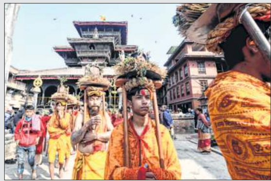
Hindu devotees participate in a religious procession during the month-long Madhav Narayan festival in Bhaktapur on the outskirts of Kathmandu on February 15, 2022.